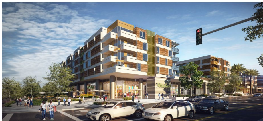
EXHIBIT A CPC-2014-1361-ZC-MCUP-SPR October 10, 2019

https://planning.lacity.org/odocument/5cc0dc7b-b682-478f-8beb-782837838539/CPC-2014-1361.pdf?fbclid=IwAR1BtcvdgN31s9m3BiZ3yEwRRYoSMPQp8mO_aPWWWjsnYUYEC1-f0N0VdvZ