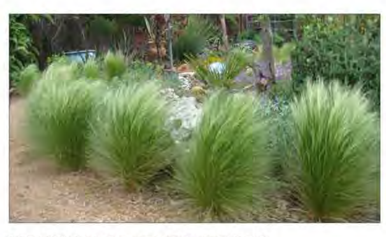
MEXICAN FEATHER GRASS