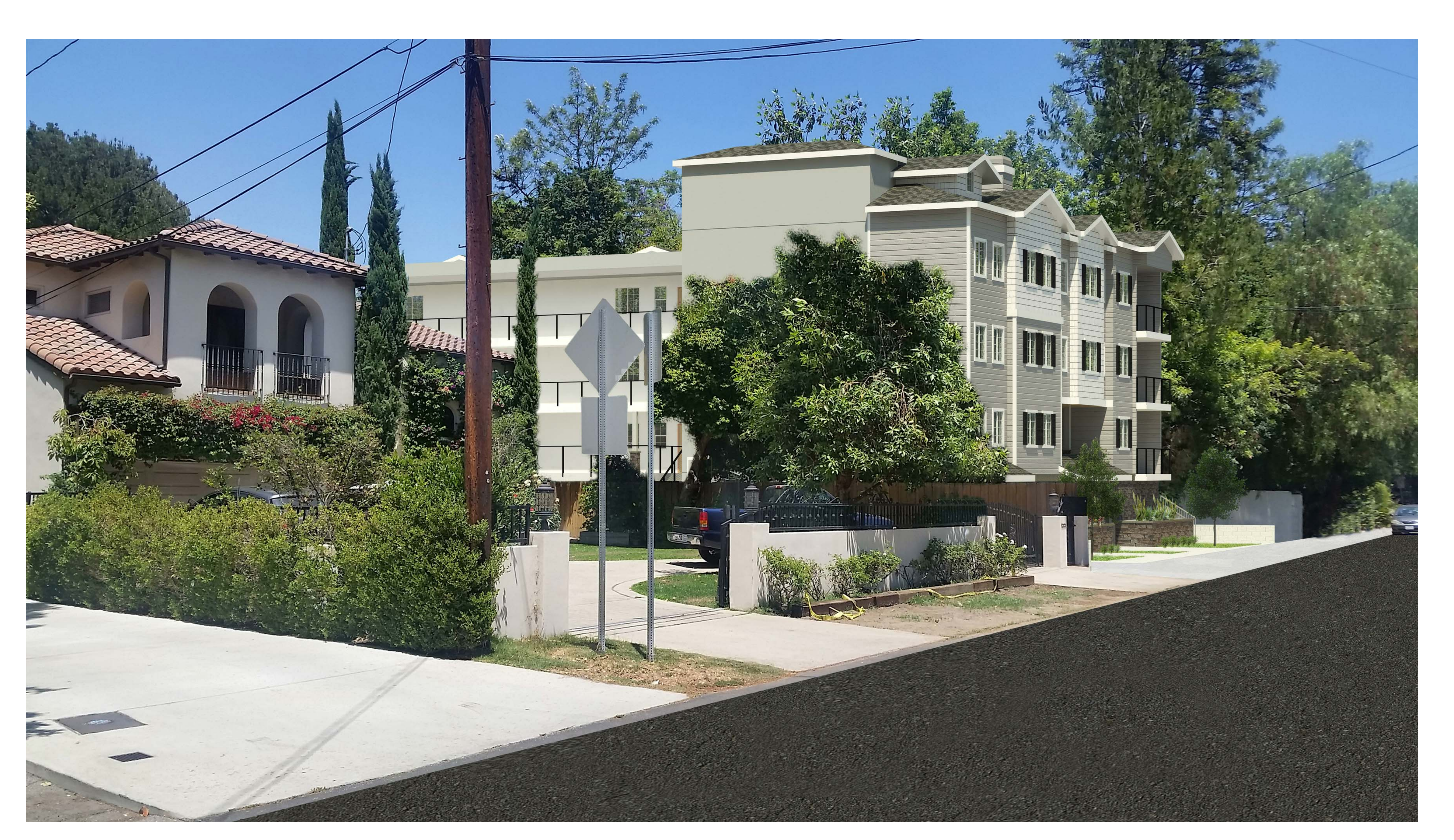
Rendering - Southwest View adjacent to Existing Residence