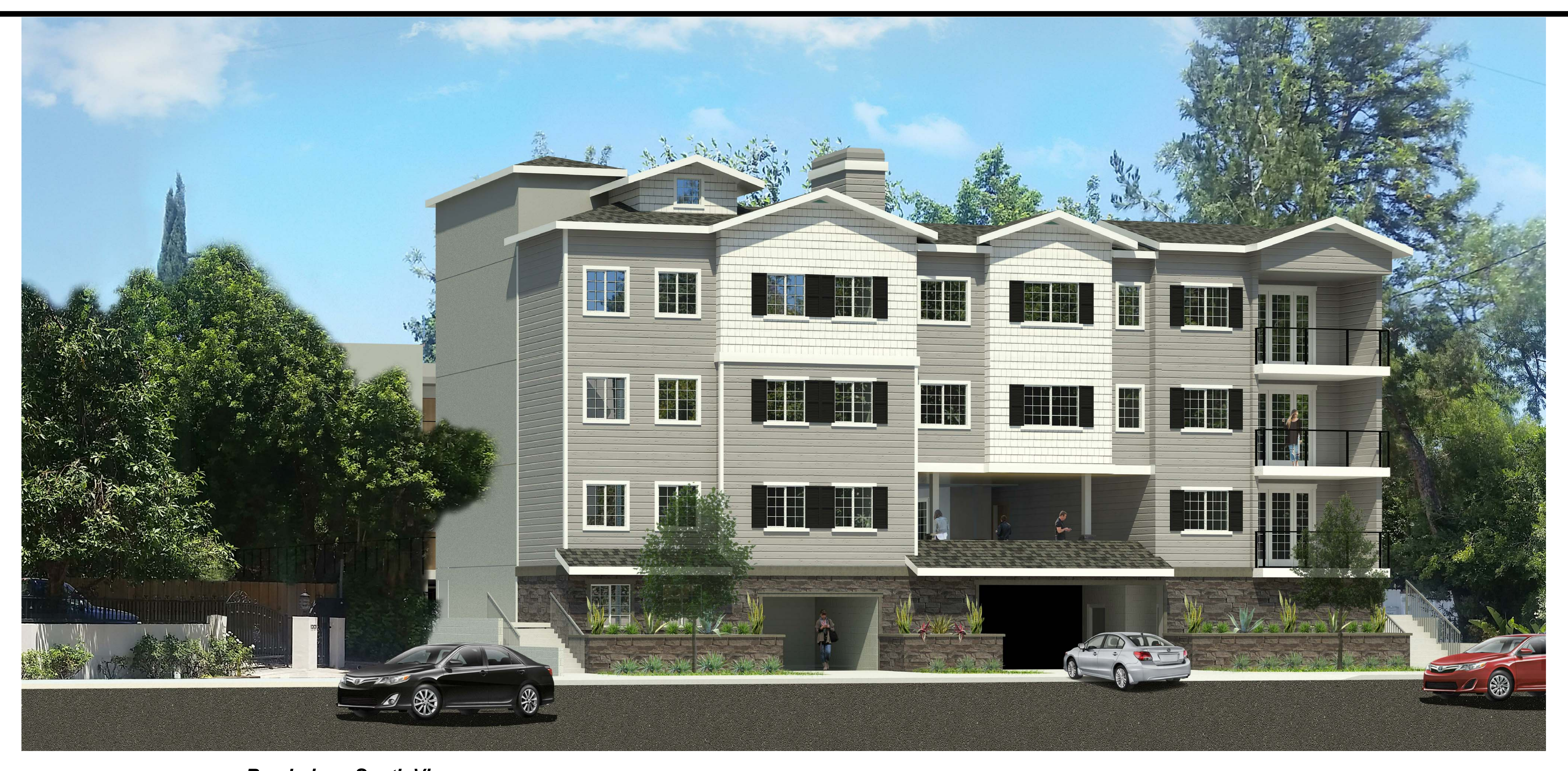
Rendering - South View