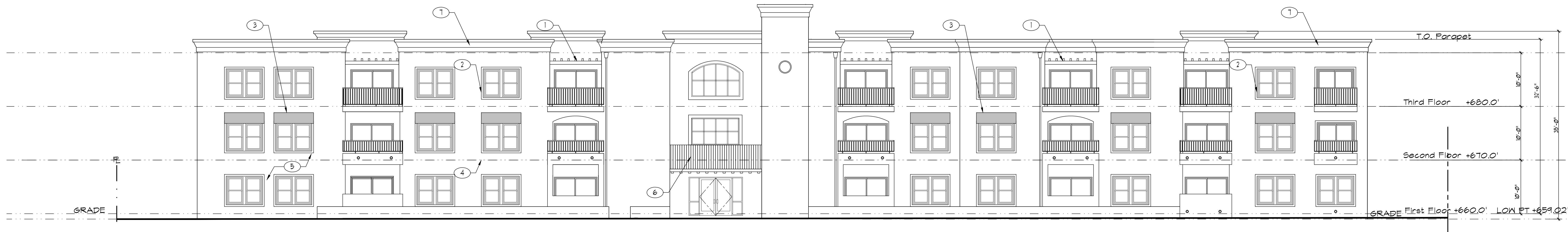
MAGNOLIA ELEVATION - SOUTH SCALE 1/8"=1'-0"